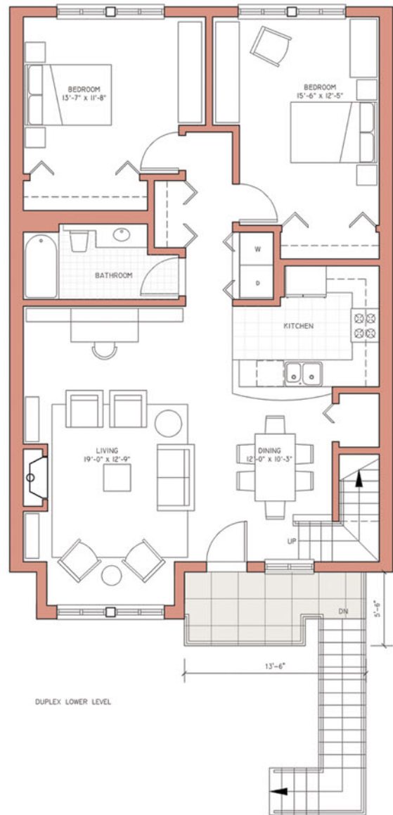
DUPLEX LOWER LEVEL